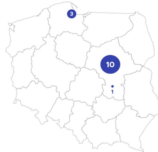
Total Fitness chain growth